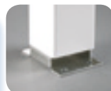
Canopy Post/ Foot