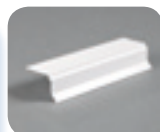
Sheet End Trim