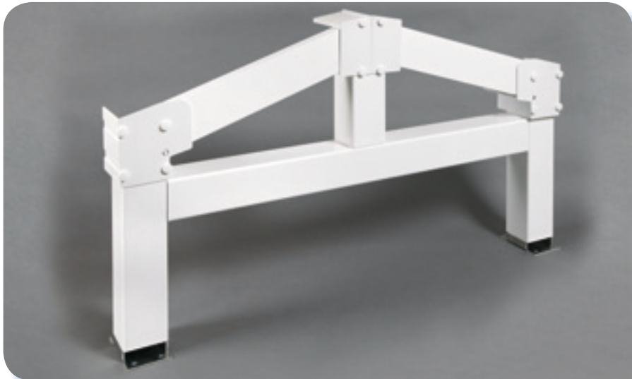
Gable Roof Design